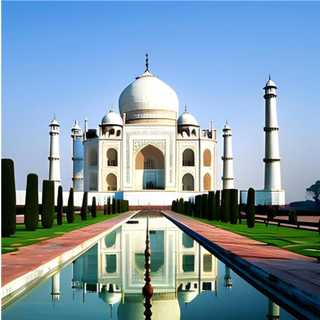
File pic: Tajmahal

The Uttar Pradesh tourism department is actively promoting Heritage Arc that run across Agra, Lucknow and Varanasi. It effectively attempts to showcase different culture, art, culture and a vast variety of cuisine. This arc has been properly connected with all modern modes of transportation. Apart from these holy places, above all the state also has one of the Seven Wonders of the World 'the wanderer' namely "The Taj Mahal" a top world heritage site listed by UNESCO.